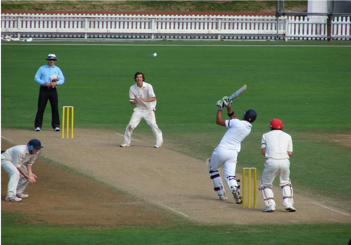
Widers hitting a 6 at the Basin vs Taita