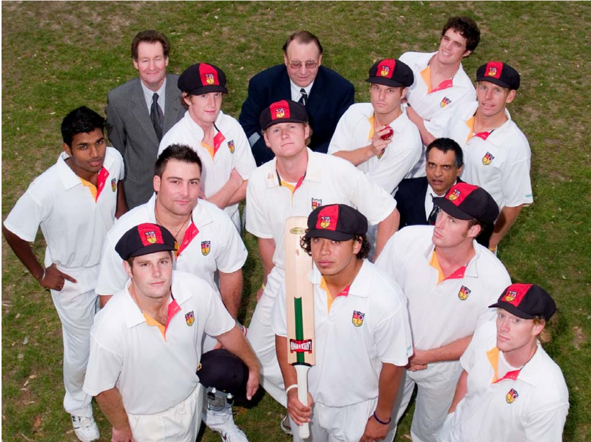
The Seniors in their new “Baggies” at Anderson Park