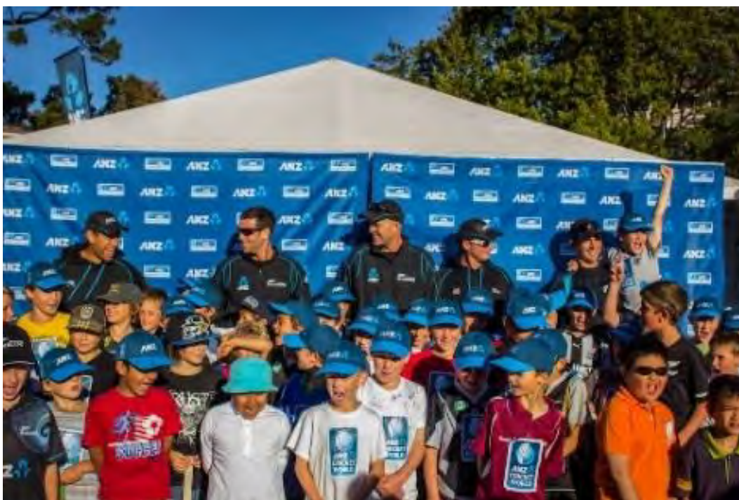
Does it get any better than this! Hundreds of kids enjoying their cricket with members of the Black Caps, ANZ Super Camp.