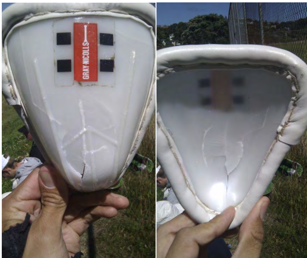
Painful, but lucky.

I think the following 2 photos succinctly sum up the 2012/2013 Sparkle Motion season: