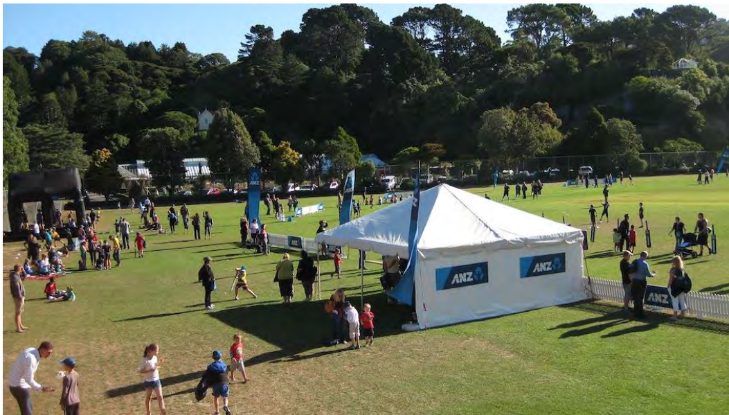
The 2013 ANZ Super Camp was hosted by Collegians at Anderson Park, 12 March. Another glorious Wellington afternoon.