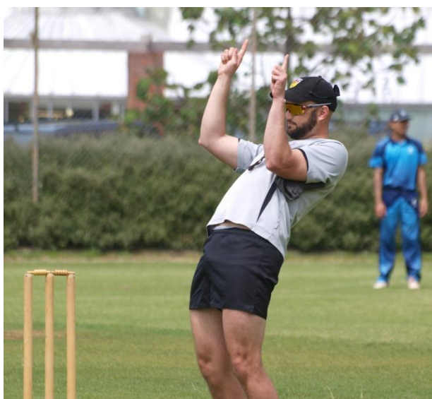
6s aren't even exciting to signal anymore.

Despite many ongoing challenges facing Collegians and cricket in general – and no doubt more to come – we have a lot to celebrate as a club. And I encourage all members, especially past members, to come to Anderson Park in the summer and get behind the boys and celebrate being a collegian and playing cricket at the best place to play cricket in wellington.