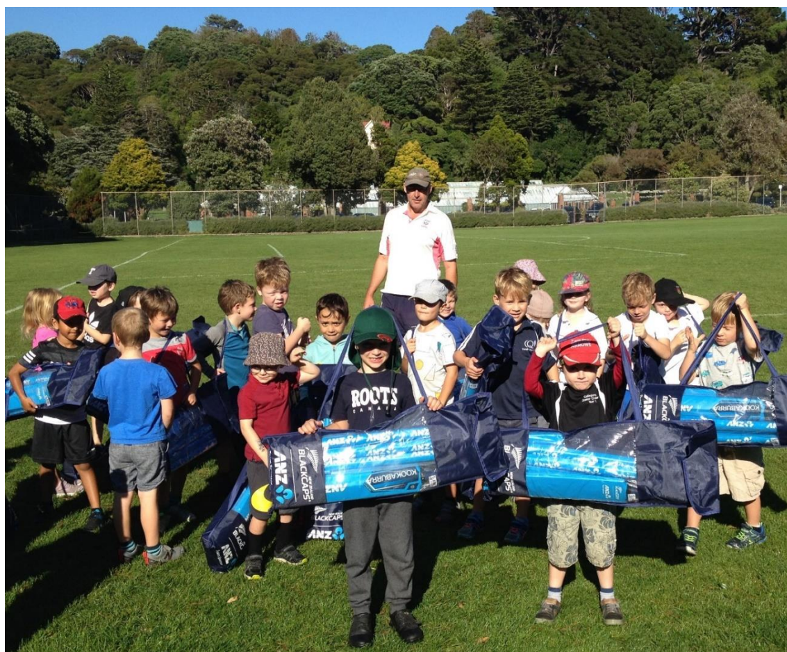
2018-19 Nursery Grade, with their cricket kit from the sponsors