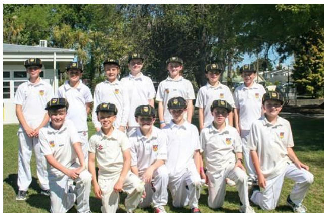
2018-19 WCJCC Year 7 Representative team, Hawke's Bay Labour weekend tournament

Wellington Collegians Junior Cricket Club registered 29 teams with Cricket Wellington for junior Saturday play during the 2018-19 season. The juniors also fielded girls teams in Sunday leagues, Year 7 and Year 8 'representative' teams, and continued the hugely popular nursery grade for those new to cricket. Registration numbers remained consistent with the previous few seasons, which is encouraging as the 2015 World Cup cricket effect has now diminished.