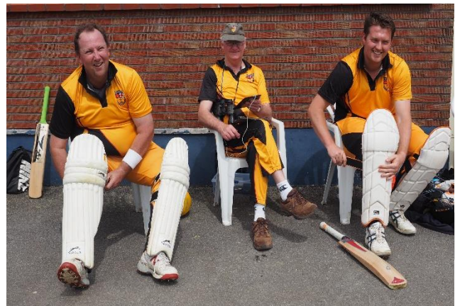
A fine set of specimen doing the job for Collegians Reserves

The club's performances on the field were highlighted by title successes for the Women and for the Falconhawks. Many congratulations to both those teams. The Senior team remained competitive but struggled to get across the line on a number of occasions, while the Reserves started strongly but faded due to lack of depth and numbers. Our other 2-day teams were all highly competitive and there were also some fine efforts from our various T20 teams. The season ended with a highly enjoyable and hard fought 3rd grade derby at Anderson Park resulting in a close win for the Chinamen.