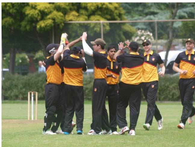
Another wicket at the home of Cricket, on ya lads.