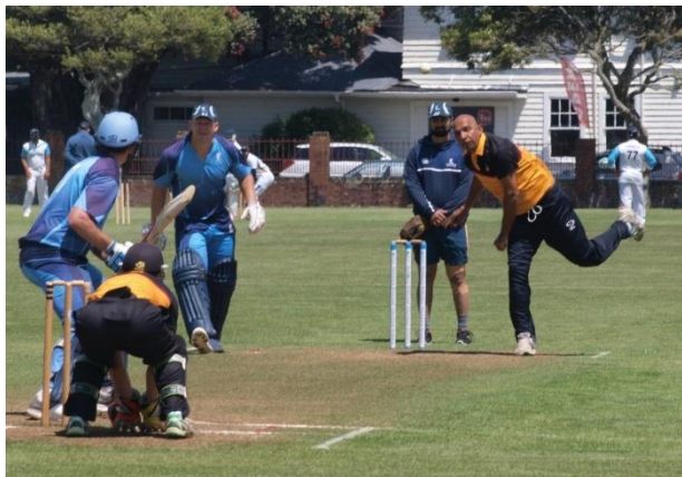
Dots on dots on dots

Reflecting on the 2018/19 season, which after a World Cup and that result in the final, all seems like a long time ago. 2018/19 was a great season for many Collegians teams, with our Senior Women's side winning the T20 competition, FalconHawk(e) winning the third grade and Sparkle Motion coming a very close second the second grade.