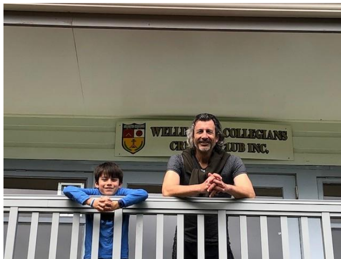
Best seat in the house