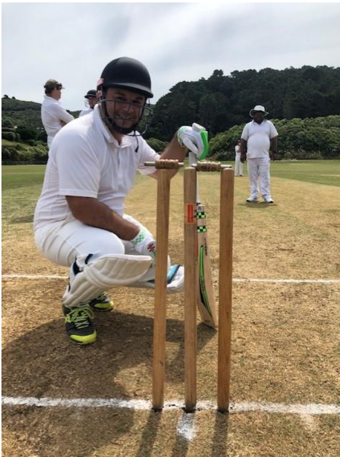
Yeah that's not out mate, good effort though champ.