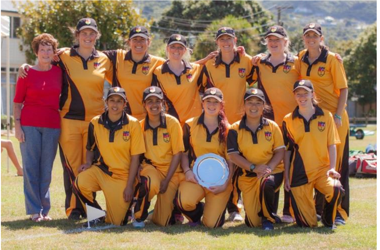
Senior Women T20 winners 2013-14, Wellington Collegians