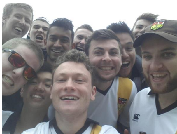
Chinamen Selfie 2014

With a new kit, the Chinamen now have a solid squad and will almost certainly be back for round four. Unlike the Lethal Weapon series however, we will improve and hopefully claim our first grade title!