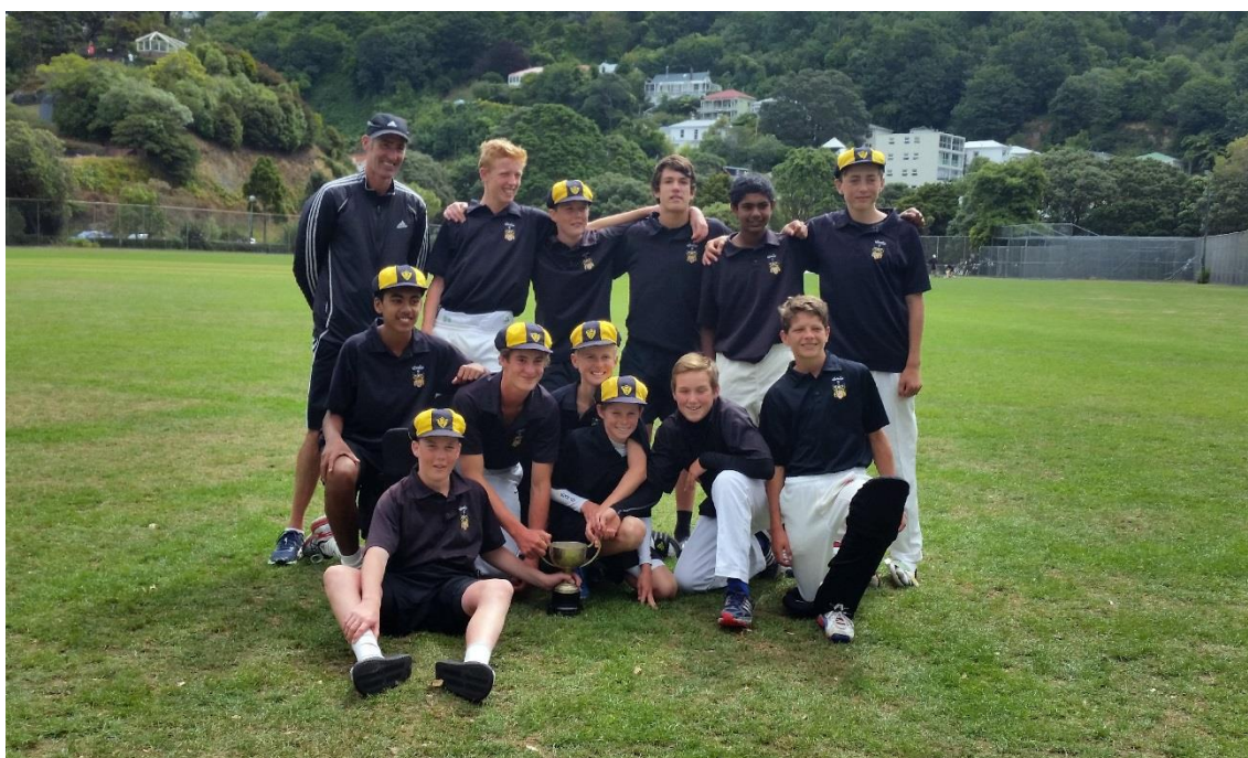
Anderson Park, the Home of Cricket, and the venue for the 3 rd Grade one-day final (top) and 2015 Wellington Junior Boys Final (bottom).