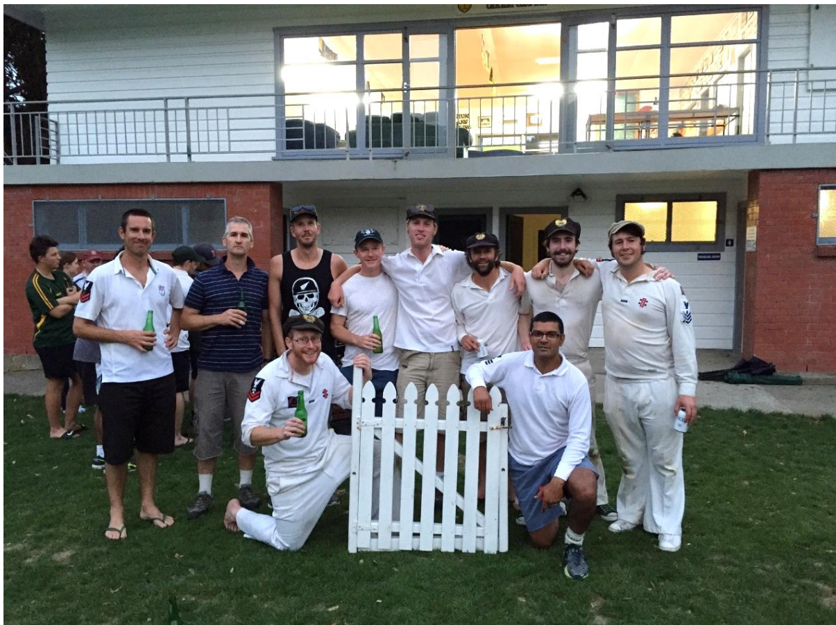
The vision of victory. The Great Bird rests after defeating University in their one-day final clash at Anderson Park.