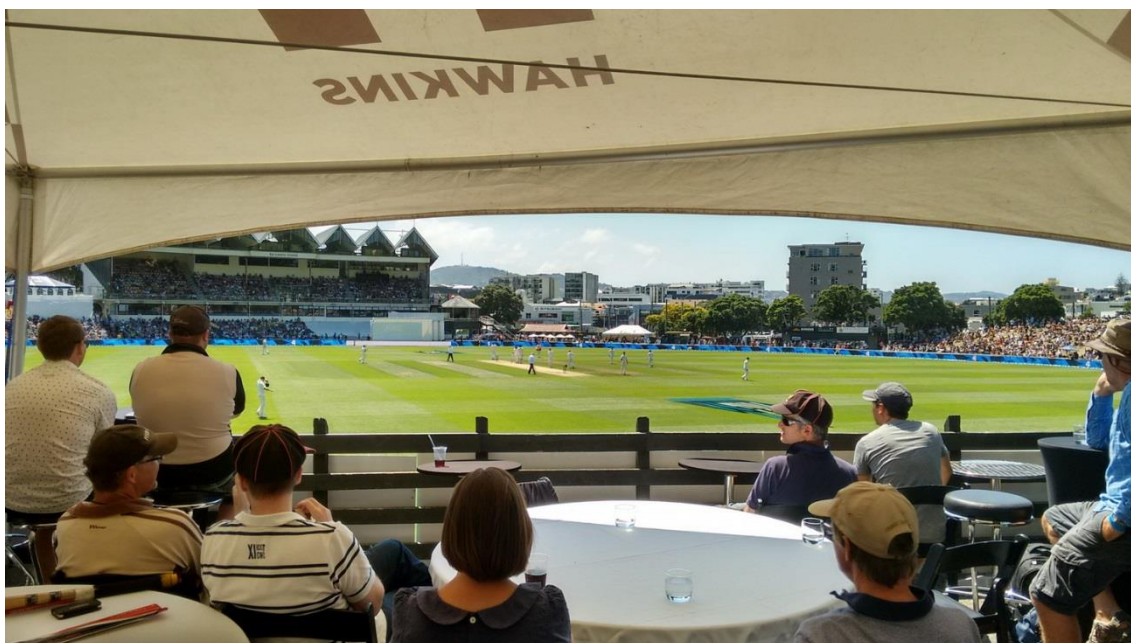
The Collegians marquee on the brilliantly sunny 4 th day of the Basin test vs Australia. Is there a better seat in world cricket?

Collegians made the most of an opportunity to host two days of catered marquees at the Basin Reserve test versus Australia. Special thanks to the staff at Cricket Wellington that released these venues to the clubs and assisted with logistics. With a short lead-in