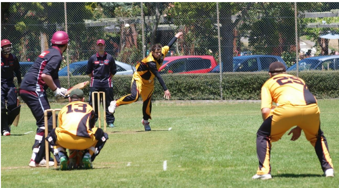
The irrepressible force of the Saturday Boltron in full flight from the Rose Garden End at the Home of Cricket. Premier Reserve match, 2015-16.

I'd like to congratulate the boys for archiving all our goals last year and I'm excited to getting back to work in the 2016/17 season.