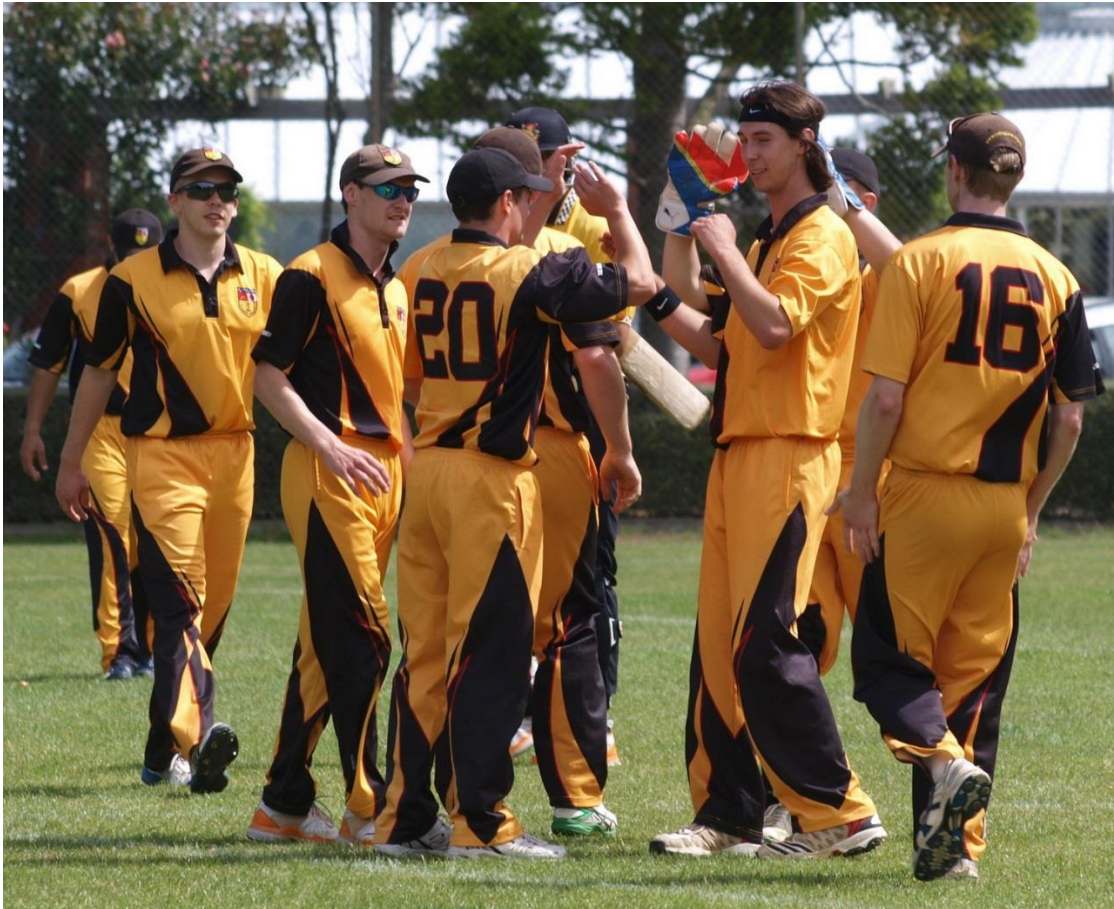
The Premier Men celebrate the fall of a wicket versus Wellington U19's.