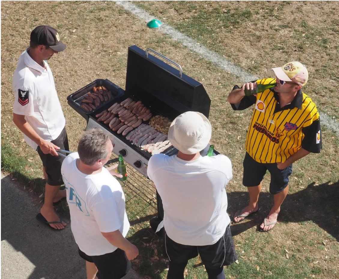
Offcuts from the highlights reel

very good attacks. Well done FalconHawk(e) - you made the Great Bird proud in 2015-2016.