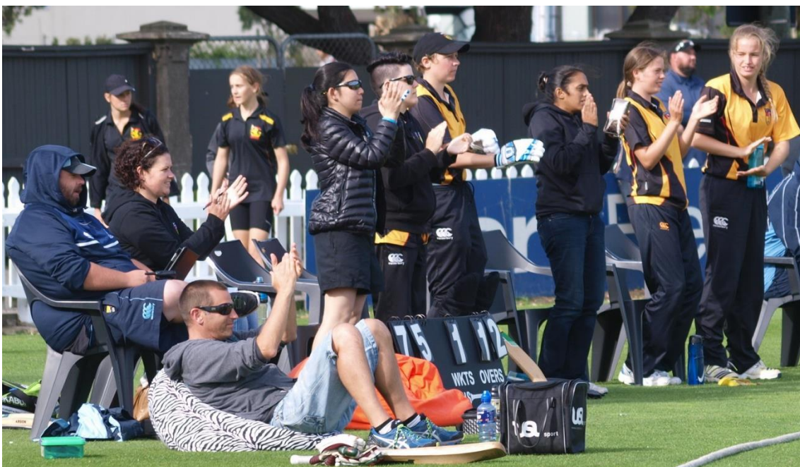
The support crew!

*In 2015/16, Wellington Collegians and Wellington Collegians players won every team and individual award available in the Premier Women's leagues.