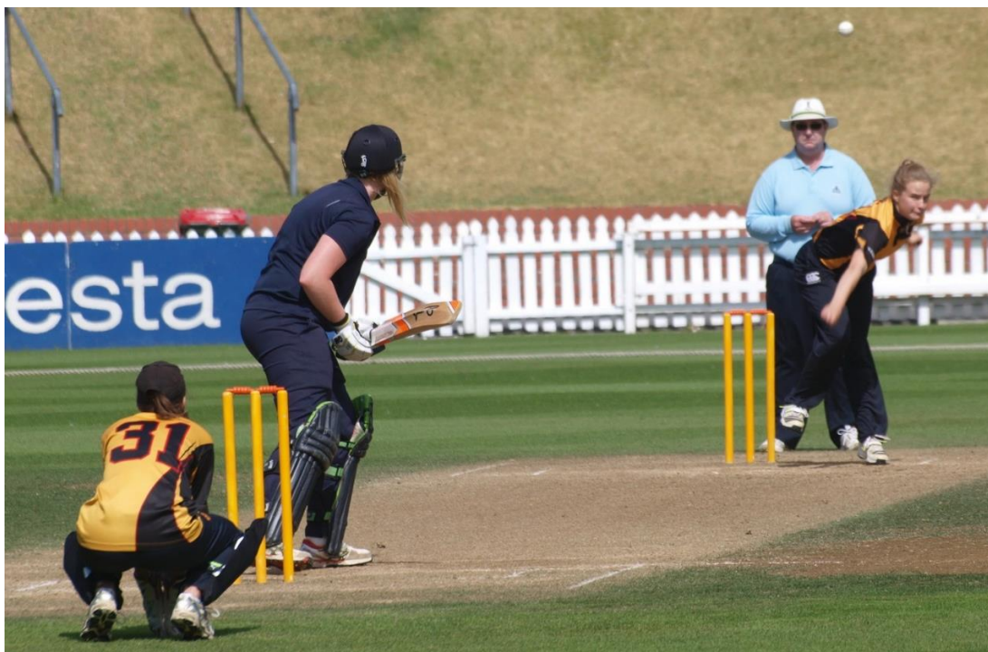
Finals action at the Basin Reserve