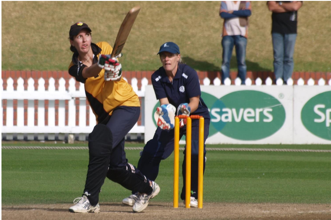
Collegians chasing down the total in the final at the Basin Reserve