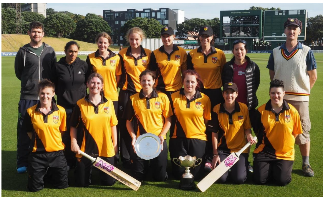
Winners of the Joy Lamason Trophy and Maureen Peters T20 Plate 2015-16.