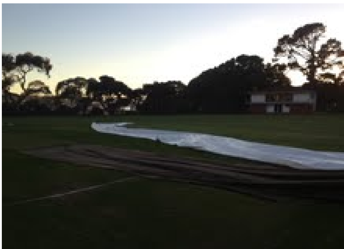
Photo: 7am covers duty at Anderson Park, February 2012.